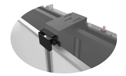
Winx® 4b Whiteboard Lock (Sold separately, article number 481A80)