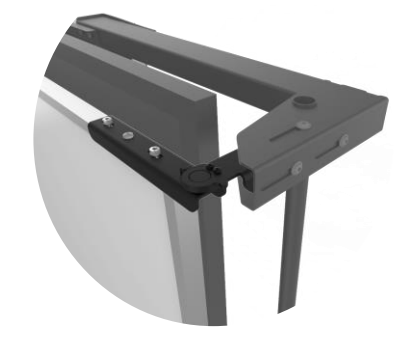
Winx® 4b Whiteboard Hinges (adjustable, 4x included)